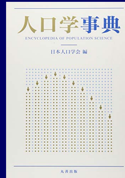
(2018) 人口学事典. 丸善. ISBN:9784621303078