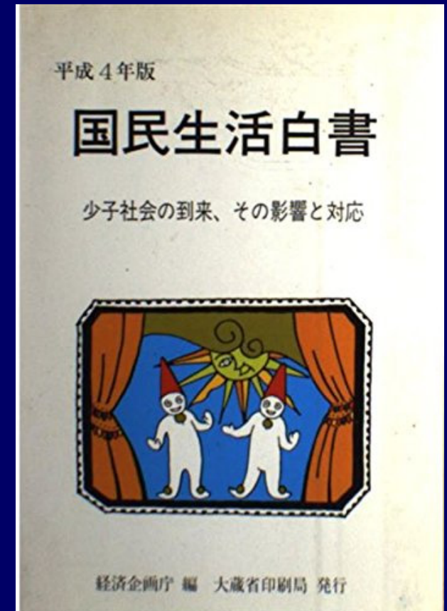
経済企画庁 (1992) 国民生活白書 (平成4年版) ISBN:4171904676